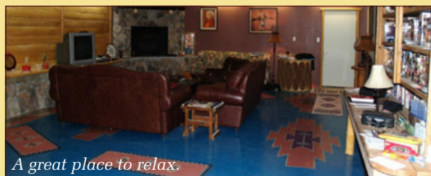
A great place to relax.