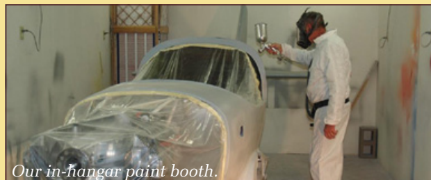
Our in-hangar paint booth.