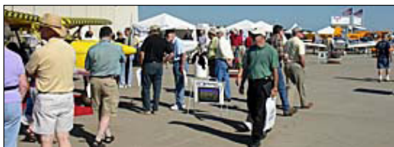
Sebring attracts strong crowds, including 2012’s record 16,000 attendees.

OK, even to me it seems rather early to be writing about Sebring 2013. (I’m a huge fan, having attended all eight Expos.) The event is months away and summer just arrived so why are we thinking about next winter? Truth be told, you don’t get anywhere in the airshow biz without planning months, even years, in the future. So, to their credit, organizers of the Sebring U.S. Sport Aviation Expo — a mouthful most of us just abbreviate as “Sebring LSA Expo” — are laying plans for the ninth Expo well in advance.